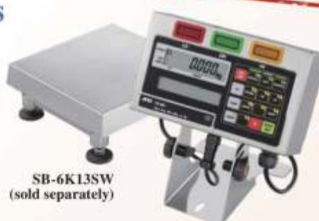
SB-6K13SW (sold separately)

*Only one of each can be selected at a time.