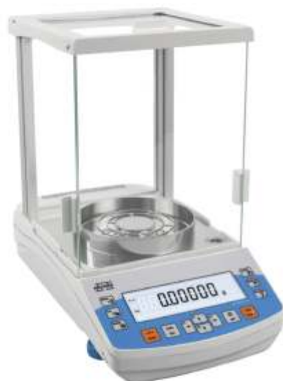
AS R2 PLUS, d = 0.01 mg

Innovative design and system solutions for standard-class products