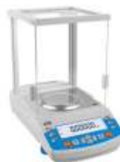
AS R1 PLUS, d = 0.1 mg AS R2 PLUS, d = 0.1 mg