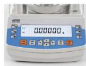
Large LCD display with text information section