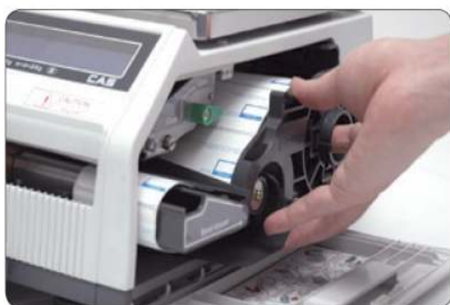
Label Cartridge ▲