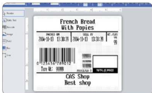
Label Editor ▲