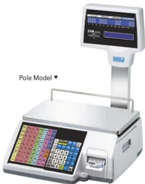
Pole Model ▼