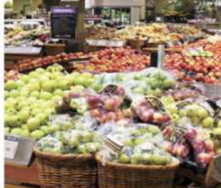
Commodity Name Display