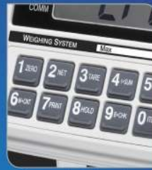
Numeric & function keys