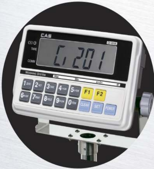
▲ CI-201A with optional pole bracket

Applicable for various weighing applications, with the added flexibility of manually setting functions via numeric keys. With various power supply options, the CI-200A series is highly portable and ideal for environments where power outlets are not available or power outages often occur.