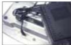
*AC Adapter (9V/1000mA)