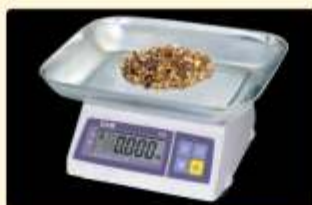
Fish tray ▲