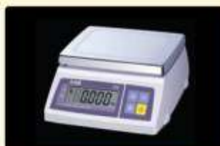
Stainless steel platter ▲