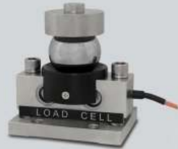
Load cells MK-QSZ